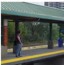
Elevated Platform Systems