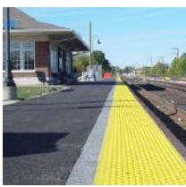
At Grade Platform Systems