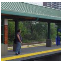
Elevated Platform Systems